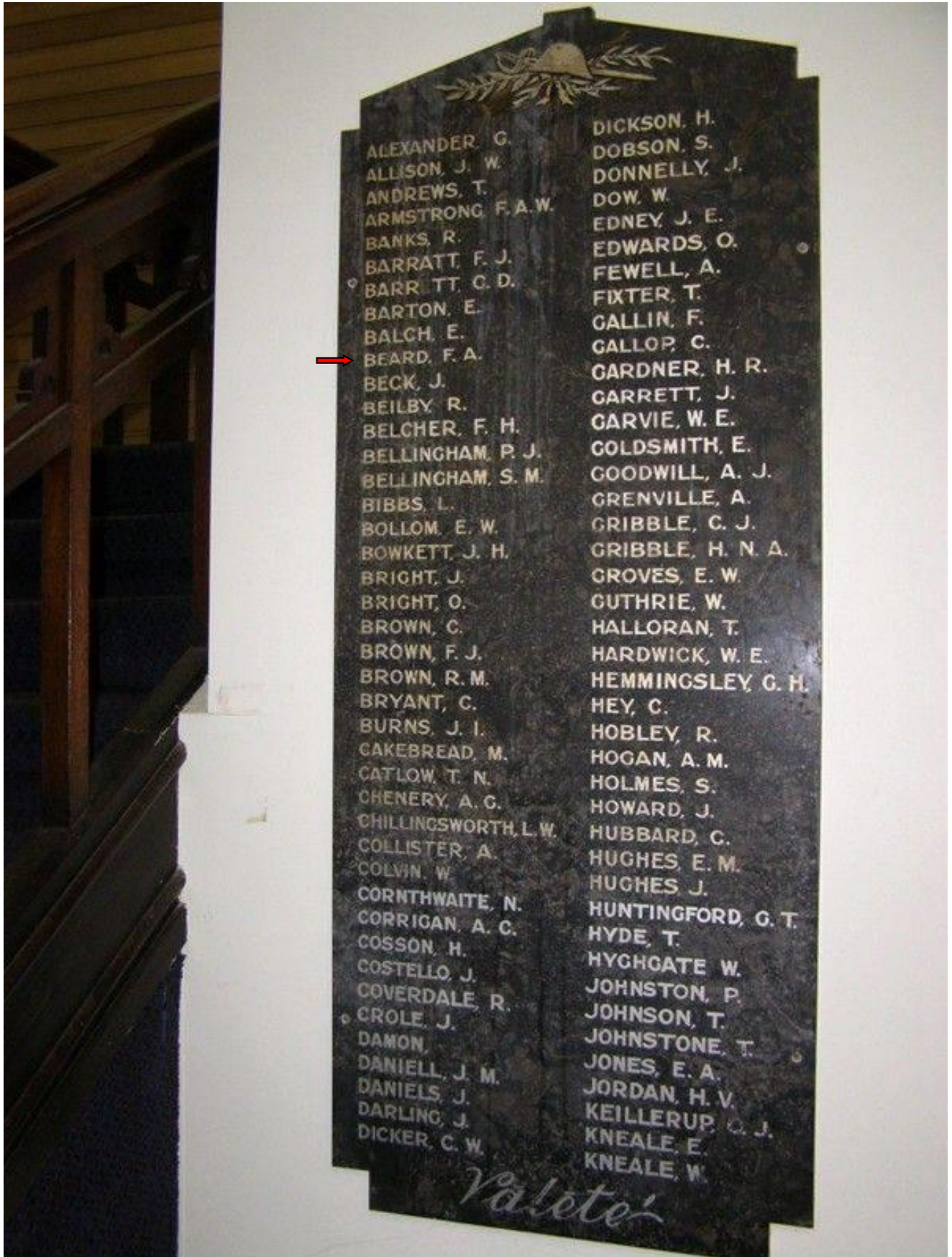
Fallen Soldiers Honour Roll