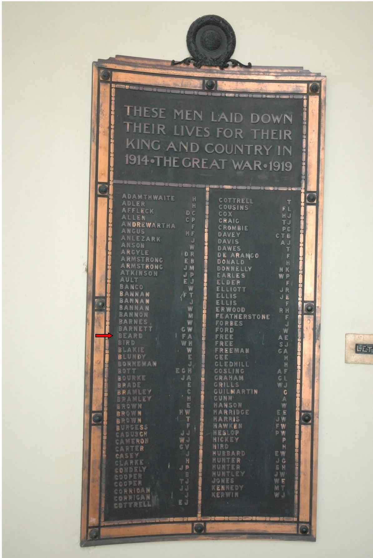
Kerang Shire Honour Roll