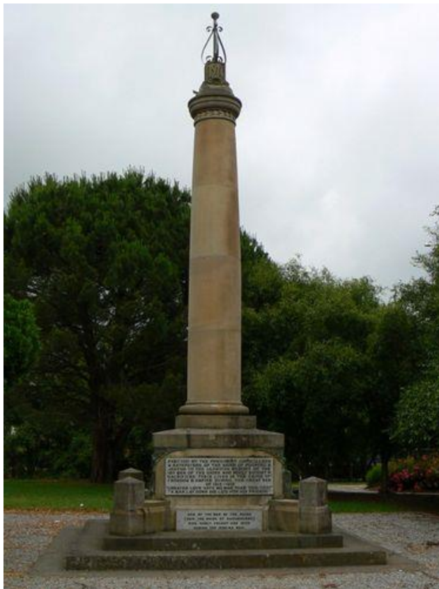
Korumburra War Memorial