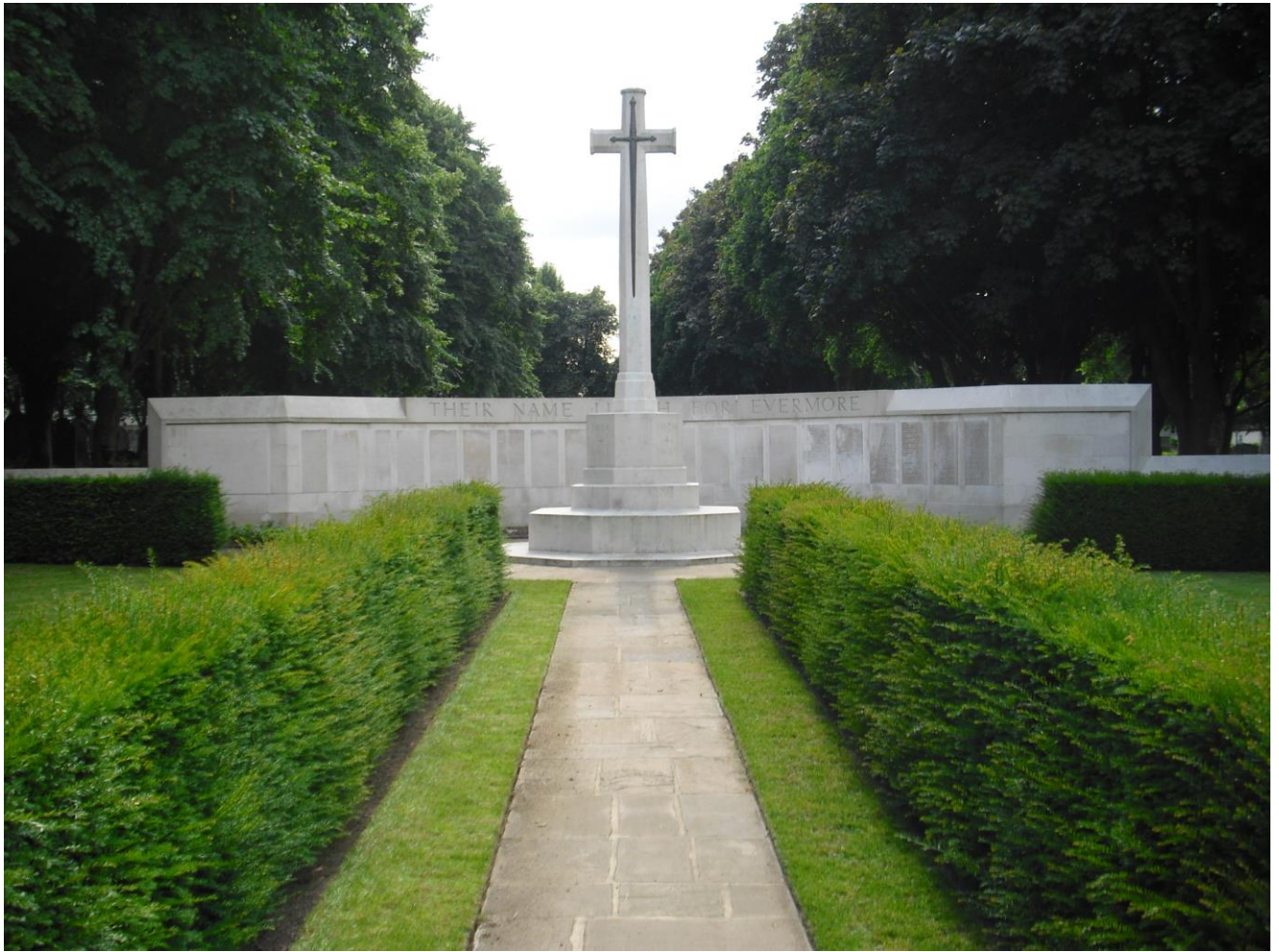
Tottenham Cemetery